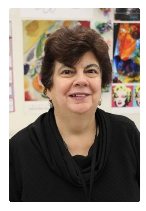
TERESA CASTALDO Middle School